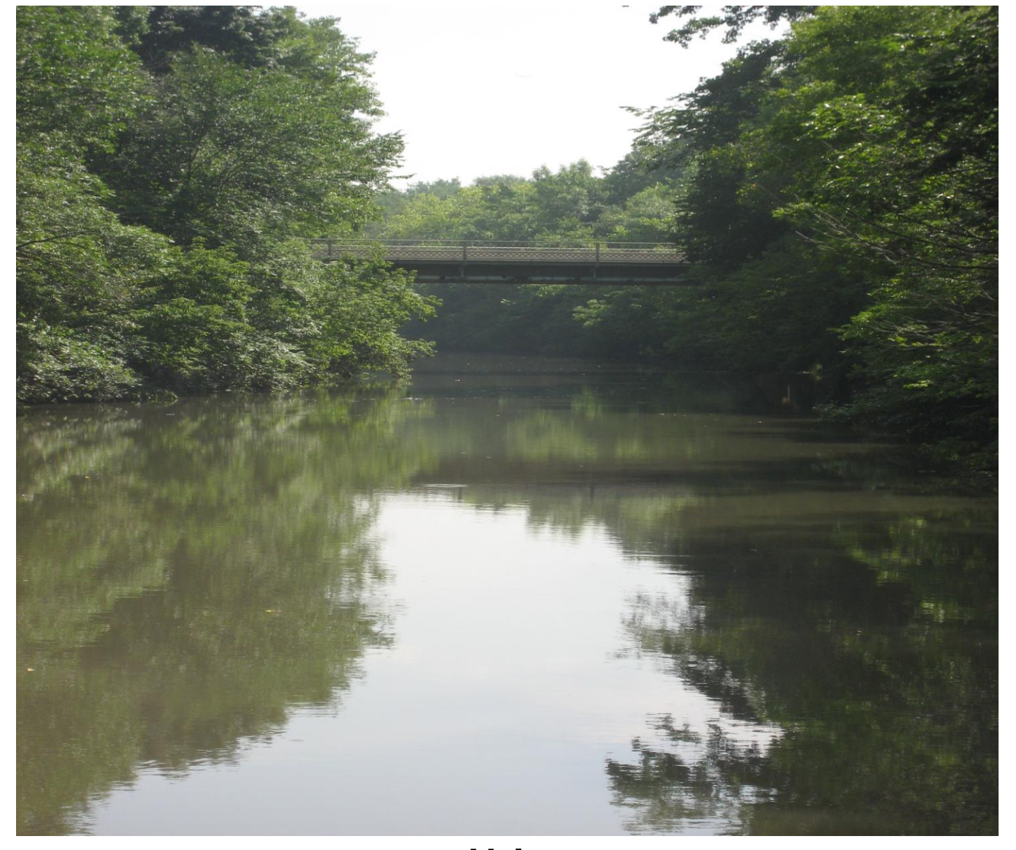
Value lightness and darkness of a color – in this case, green