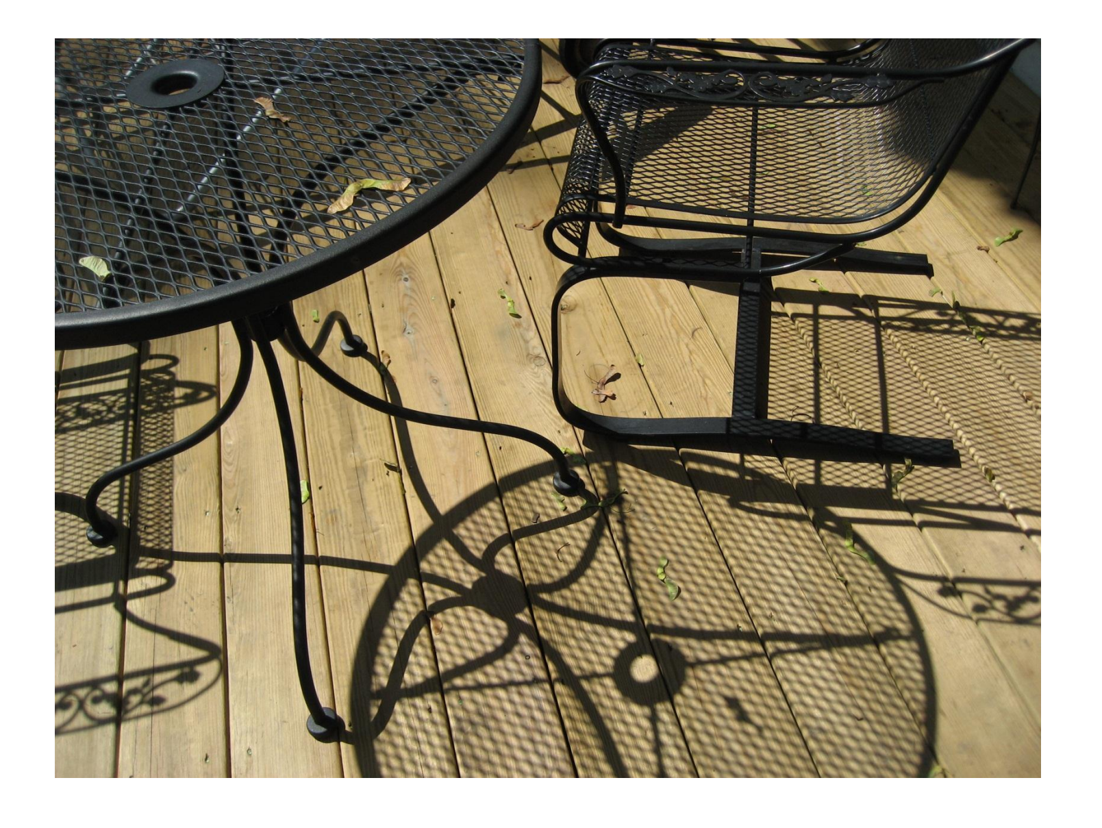
Line is a a mark with greater length than width. The iron furniture and the shadows it casts make a variety of lines (diagonal, curved, thick, thin).