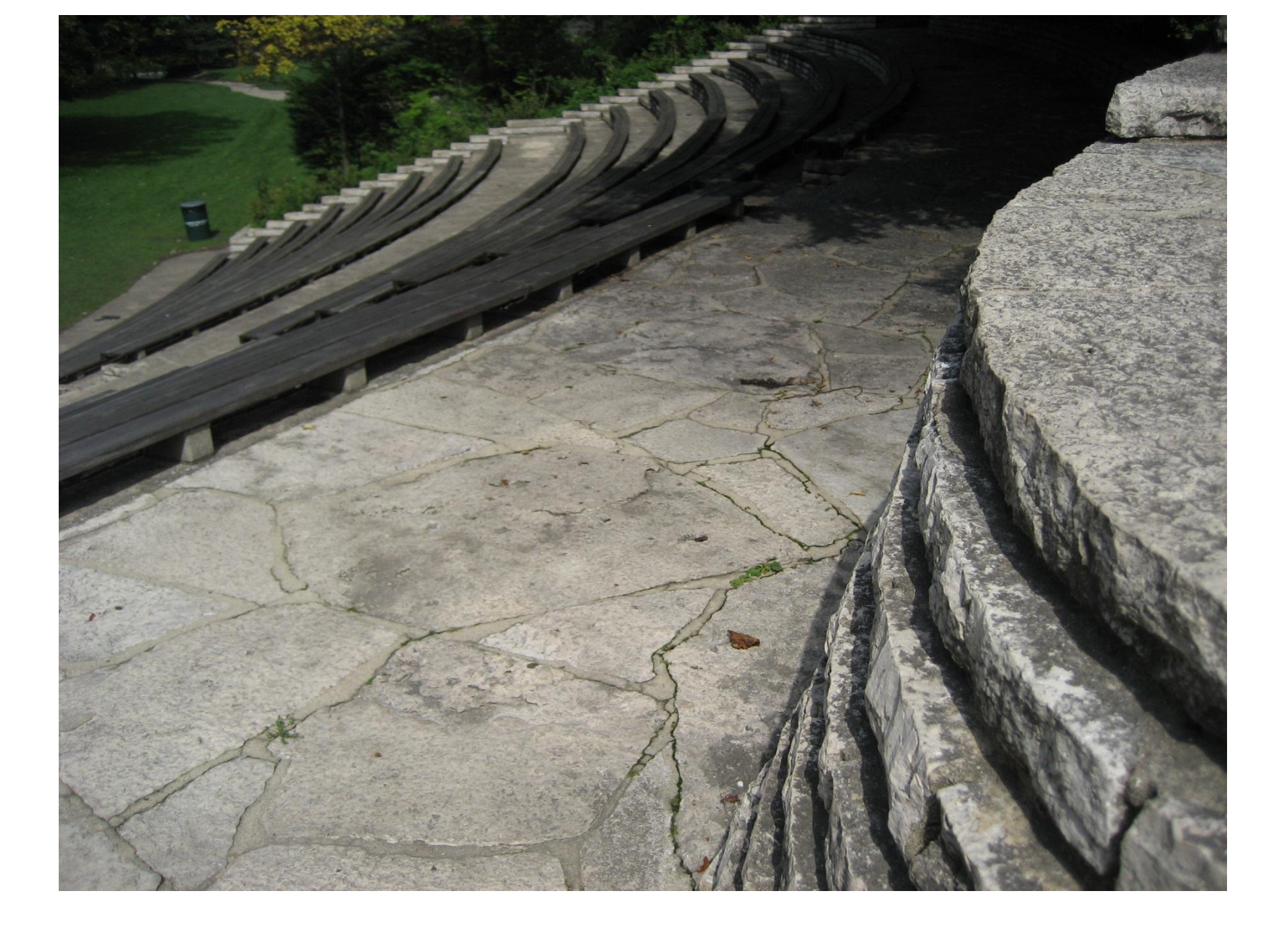
Movement is the path the viewer's eye takes through an artwork. The viewer's eye is directed along the lines of the curved rocks.