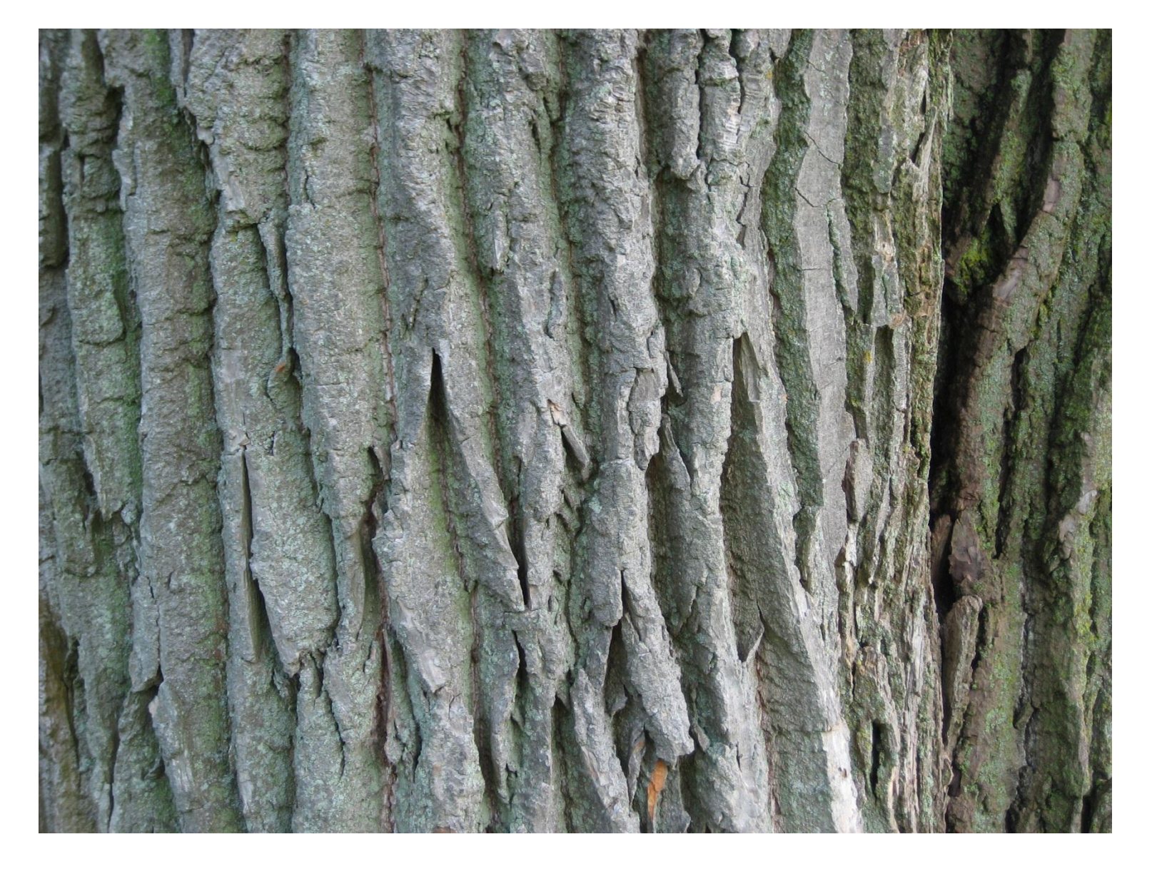
Texture is the surface quality that can be seen or felt. This bark has a rough, craggy texture.