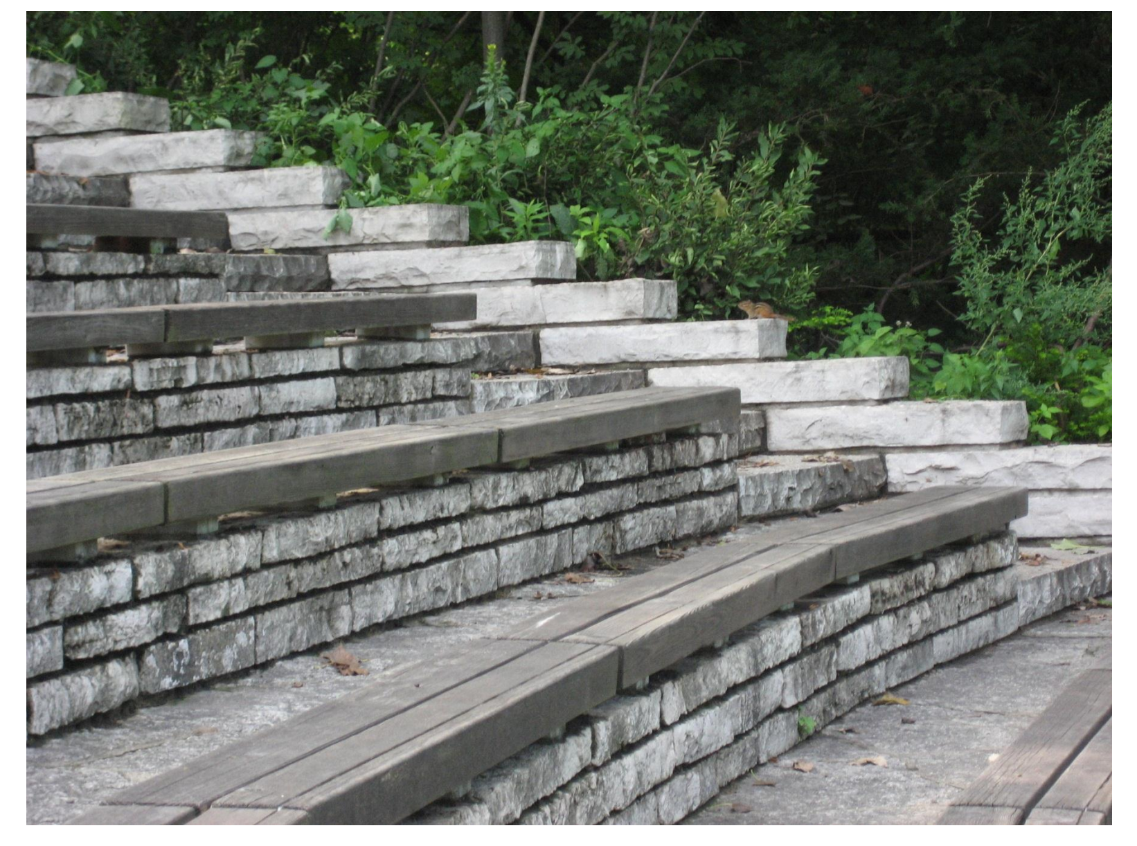
Rhythm is created when one or more element is repeated to create a feeling of organized movement. The stones are repeated in an organized (diagonal) pattern.