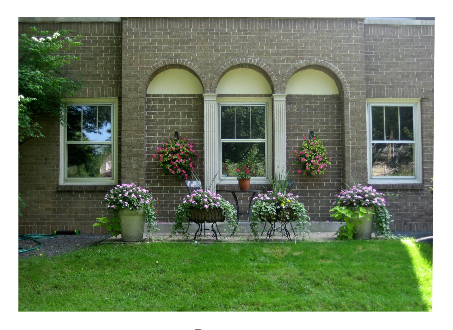
Pattern Repeating object