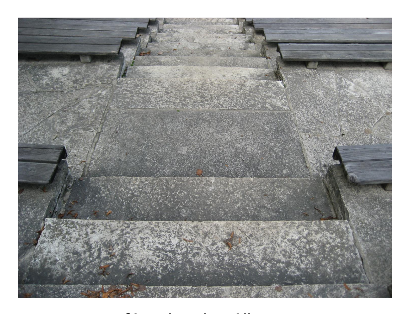
Shape is a closed line. These steps are geometric (rectangles) and they organize the picture through repetition.