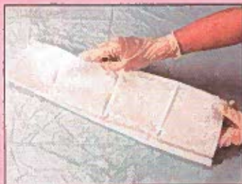
2. Fold one side down, turn over and fold the other side down as shown.