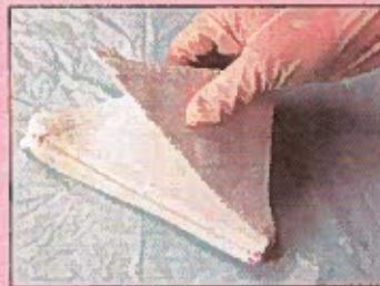
3. Fold into triangles, folding back and forth in an accordion style.