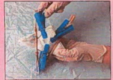
4. Clamp corners of triangle folds with chopsticks and rubber bands. Clamp on clothespins, using 2 clothespins in each location to accommodate thickness. Apply dye.