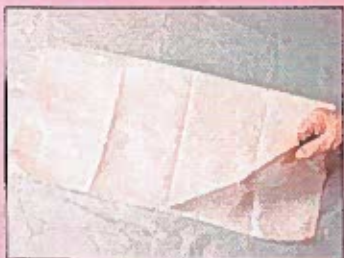
1. Soak napkin in fixer solution. Fold napkin in half with right side in.