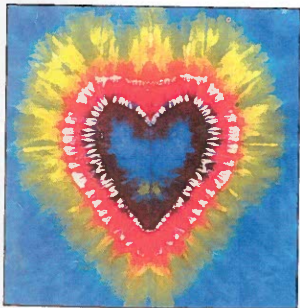
Heart Scarf - Turquoise, Fuchsia and Yellow dye Stitch heart following instructions. Dye referring to photo.

Stitched Designs - In most tie-dyed designs, fabric is bound with rubber bands. However a more controlled design can be achieved using stitching. A line is drawn, stitched and gathered. If possible rubber bands are added on top of stitching to bind fabric more tightly for a distinct design. The design should be symmetric and basically round when using rubber bands. For these designs use a large eye needle and dental floss which is stronger than ordinary thread. When you apply dye, be sure to get it down into folds of bound design.