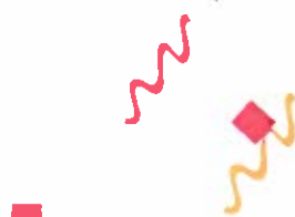
Rainbow Heart - Turquoise, Fuchsia and Yellow dye

You'll love experimenting with different shapes, designs and color combinations.