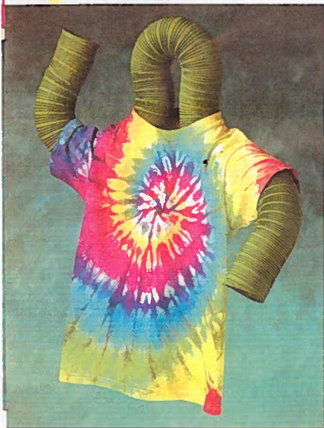
Rainbow Swirl - Fuchsia, Yellow and Turquoise dye

The Swirl is a popular design that can be done with many variations. The basic technique is simple. Press down at center of fabric and twist until all fabric is swirled into a flat pancake shape. Bind with big rubber bands crossing them in center so shape is divided into wedges. This design can be varied in many ways depending on how colors are applied to wedges.